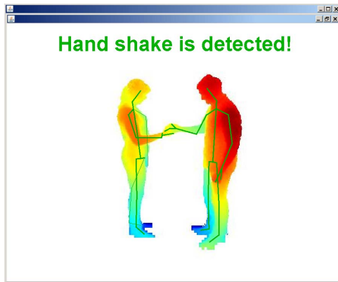
Fig. 2. The handshake is detected by the logic program.